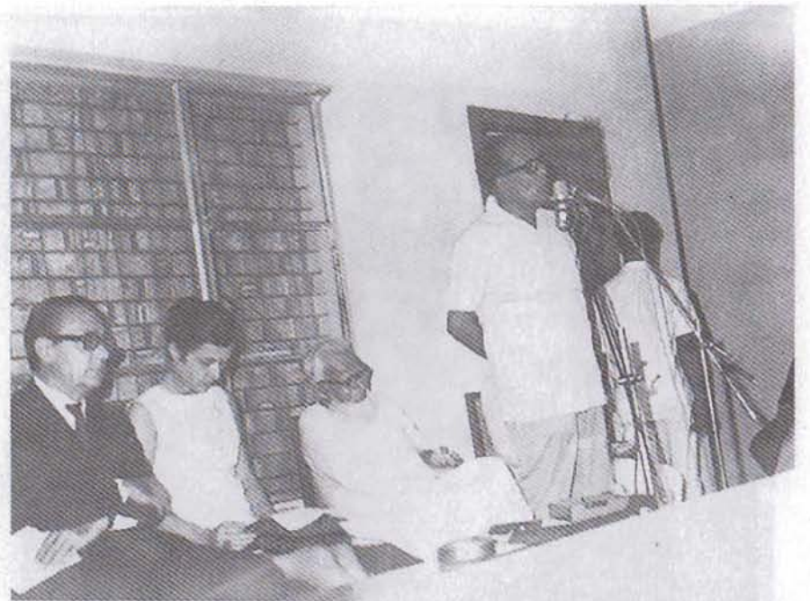
Doyen of arts in Bangladesh, Zaynul Abedin speaking. [ April 1973 ]